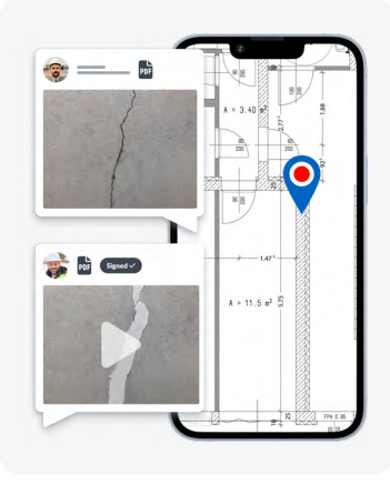
Communicate using in-app chat, with all conversations stored in a digital audit trail