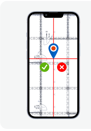
Track all tasks, directly on-plan