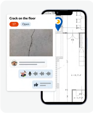
Add photos, video & voice notes, for clear communications