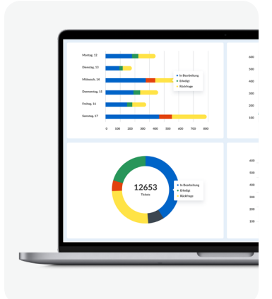
Monitor project progress, identify delays early and reallocate tasks based on resourcing to keep projects on track