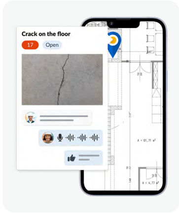
Add photos, videos & voice notes for detailed and clear documentation