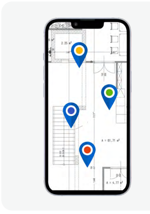
On-site inspections become effortless, with all information tracked on-plan