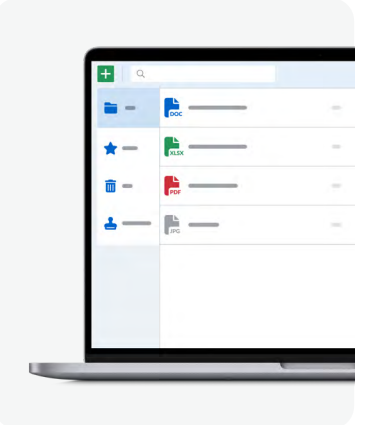
Own all project data with all reports, plans & documents stored in one place